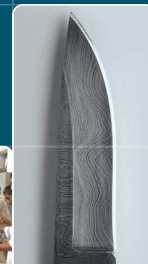
DAMASCUS SWORD BLADE