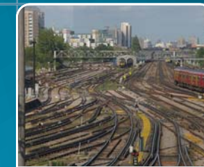
RAILWAY EXCHANGE YARD