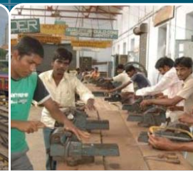
TRAINING - MAKE IN INDIA