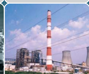
THERMAL POWER PLANT